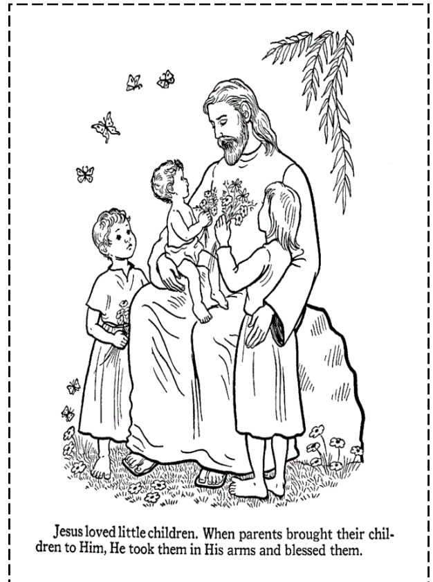
Jesus loved little children. When parents brought their children to Him, He took them in His arms and blessed them.